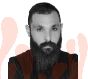
Make-up artist and costume designer